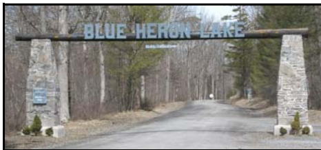
Blue Heron Lake Private Community

Porter Township's history as a recreation and vacation destination has an interesting effect on its housing situation. Originally, the majority of housing was built for seasonal use and some 480 are cabins on leased state forest land. In recent years, many of these seasonal homes have been converted to permanent residences, enabling the Township to absorb a growing population without the need to consume large amounts of land for new housing. On the other hand, some seasonal homes were not designed and constructed for permanent occupancy, leading to problems with housing conditions and associated water quality problems from inadequate on-site sewage disposal systems.