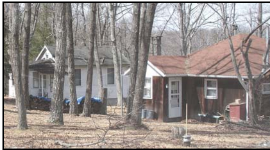
Cabins at Lake Minisink