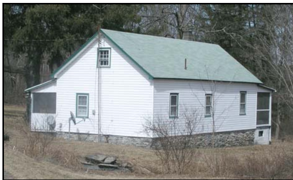
Older Home, Route 402

The data in the Rate of Housing Development Table provides a good measure of the age and potential condition of housing in the Township.