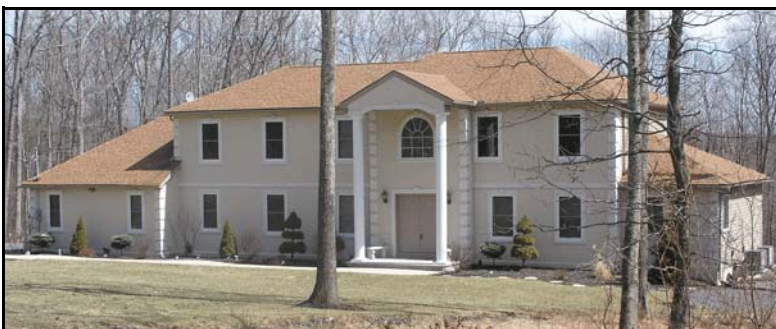
Contemporary Home, Spruce Run

housing cost increase with the need for affordable housing is difficult, particularly when coupled with the problem of providing adequate sewage disposal and water supply for higher density housing in an area such as Porter Township with many marginal soils, high quality streams, and the economic importance of good water quality of the lakes in the Township and region.