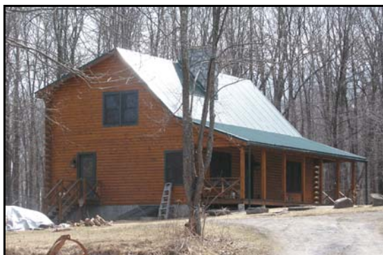
New Home, Route 402