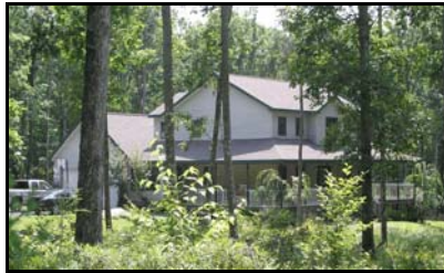
Contemporary Full-Time Home