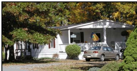
Grampa’s Woods Retirement Community