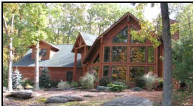
Contemporary Vacation Home

Real estate values in the Township, and all of Pike County, have increased rapidly given the appeal of the quality lifestyle so close to metropolitan areas. The Township’s recreational appeal and natural setting are key factors. As the housing market recovers and the longer term demand for land and housing continues, the cost of real estate will obviously also continue to increase. Balancing this demand driven housing cost increase with the need for affordable housing is difficult, particularly when coupled with the problem of providing adequate sewage disposal and water supply for higher density housing in an area such as Palmyra Township with many marginal soils, high quality streams, and the economic importance of good water quality of Lake Wallenpaupack, Fairview Lake and other area lakes.