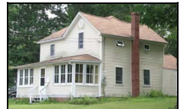
Older Home in Cromwelltown

Housing Growth Accommodate anticipated housing growth in appropriate locations, at appropriate densities, and with suitable amenities.