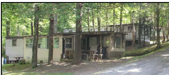
Mobile Home Park, Bartelson Road