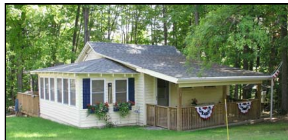
Remodeled Vacation Home